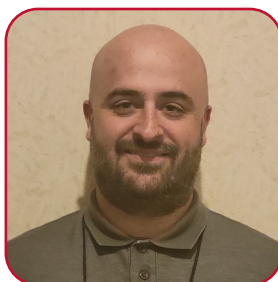
Aram Beladi Village of Northbrook Year 2