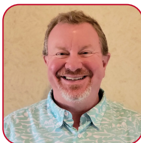
Sean Henry Klingner & Associates P.C. Committee